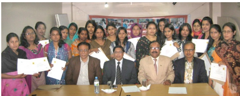
A group photo of trained rural female journalists, government officials and organiser. Programme was held at Khulna in December 2012, supported by Free Press Unlimited

Both the trainings were based on the basics of journalism and news reporting. The trainers work hard to make them aware about professional ethical issues and behavioural change, and engaged them in practices for improving their report writing skills.