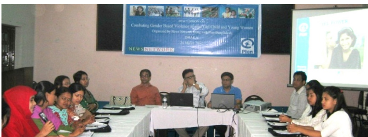
Plan International supported a discussion meeting on combating gender based violence against girl child and young women were held at Dhaka on 24 March 2012. Participants and speakers are seen in the picture.

A good number of news-features were prepared and released to major newspapers for publication. Those items got good coverage with due credit. It has also published two different half-yearly newsletters and disseminated those to Plan Bangladesh partners and beneficiaries. The objectives of the newsletters are to promote gender equality and empower young women.