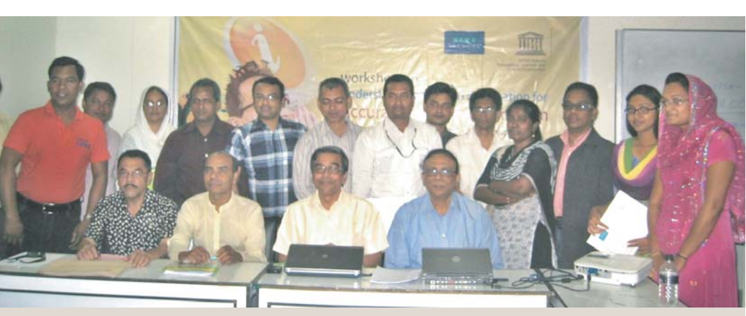
Journalists participating at a RTI workshop pose for a group photo. The workshop was held in Barishal city on 2-3 March 2014.

All the workshops were interactive and participatory. The participant journalists found the workshops useful and effective. It improved their capacity to deliver better reports with accuracy of information.