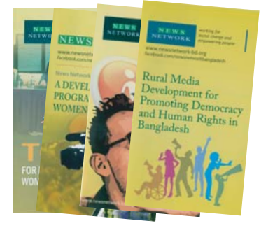
Shahiduzzaman Editor, News Network

Total grant amount of BDT 8,999,803 (USD 116,881) were received from the donors and at the year end the expenditure stood at BDT 3,355,563 (USD 43,579).