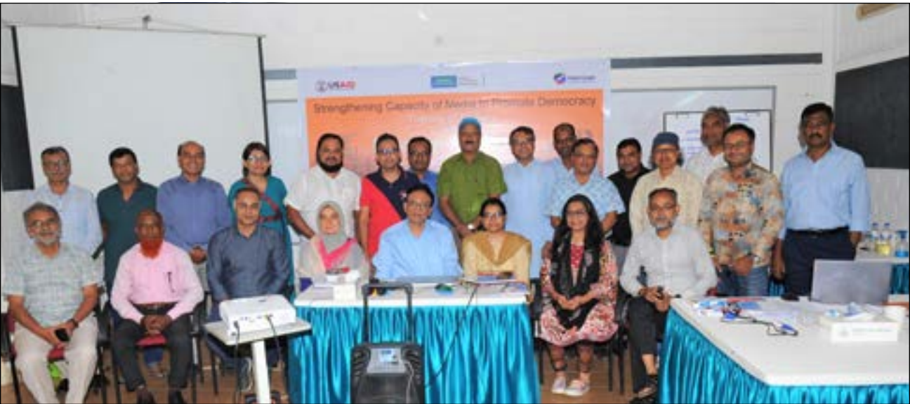
A group photo featuring participants of the Training of Trainers (ToT) program from across the country, along with trainers and distinguished guests.